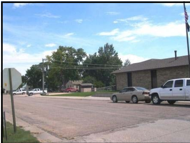
Street scene to the southwest. Taken from the Southwest corner of the property.