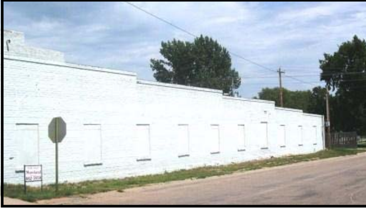
South Side of Building